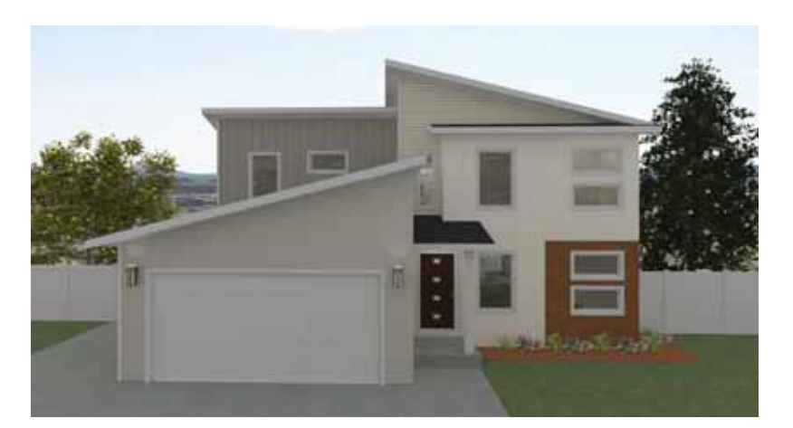
Architectural Style - Modern