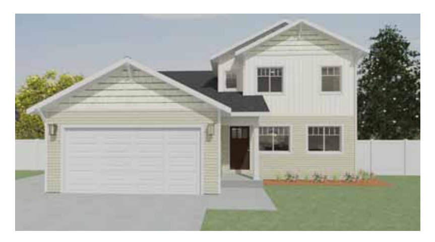
Architectural Style - Craftsman