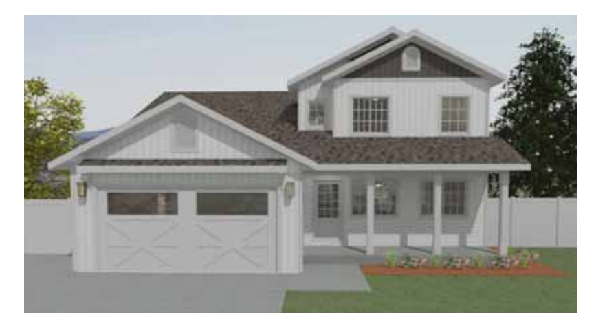
Architectural Style - Farmhouse